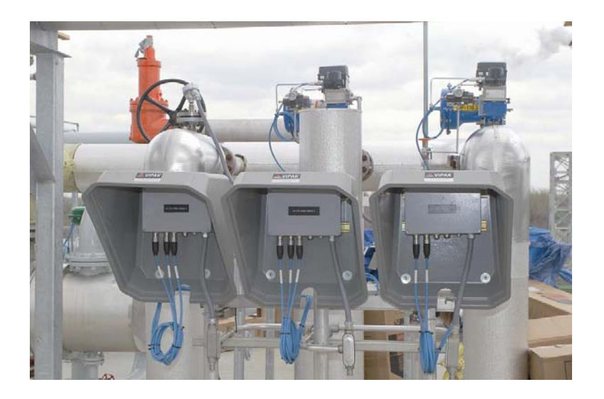
Fig. 3: FieldBarrier with FISCO spur connections