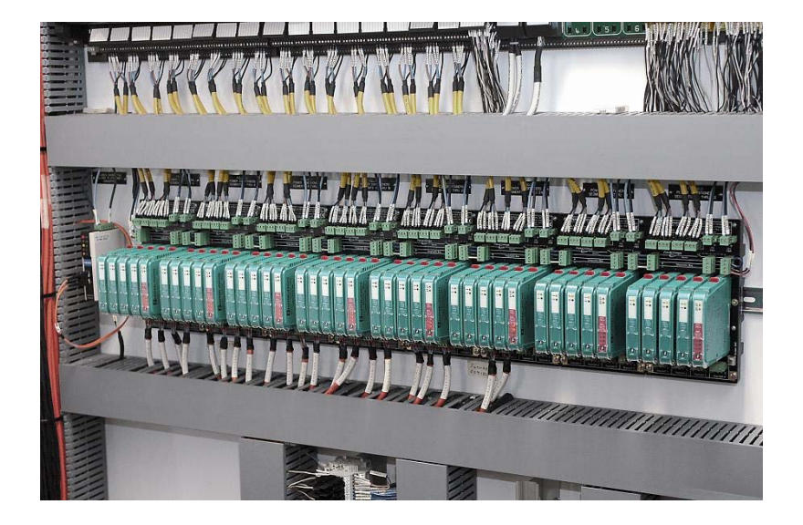
Fig. 2: Fieldbus power supplies with physical layer diagnostics