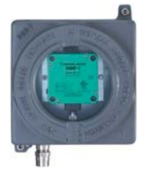
RFID sensor in Ex d enclosure