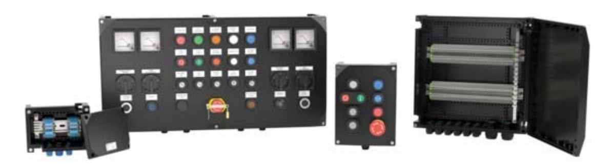
GR enclosure series with type of protection Ex e